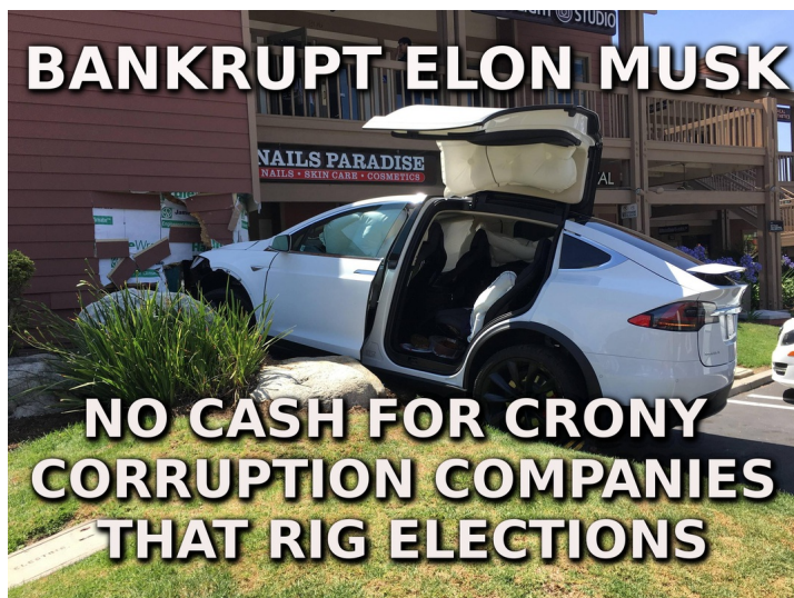
Tesla's out-of-control sudden-acceleration surge defects and exploding batteries are not as bad as Tesla's out-of-control corruption and bribery.

ELON MUSK'S PAID-FOR FAKE NEWS MEDIA SHILLS. THEY COVER UP HIS CORRUPTION AND PUSH PUFF-STORIES ABOUT MUSK. NEVER TRUST THEM TO BE ANYTHING BUT BIASED PROPAGANDA OUTLETS. MANY OF THEM OWN TESLA STOCK: Electrek, Google, Facebook, CNN, Huffington Post, Dianne Feinstein's PR office, Nancy Pelosi, Steven Chu, MSNBC, PayPal, KPXV-TV, San Jose Mercury News, Any Hearst owned entity, The SF Chronicle, Motley Fool, Green Car Congress, The executive staff of the DNC, The NY Times,