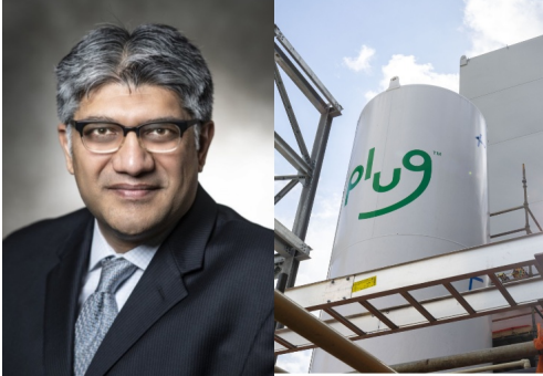
Jigar Shah, hydrogen facility

Plug Power has already raked in $70 million from insider scams with the Biden administration