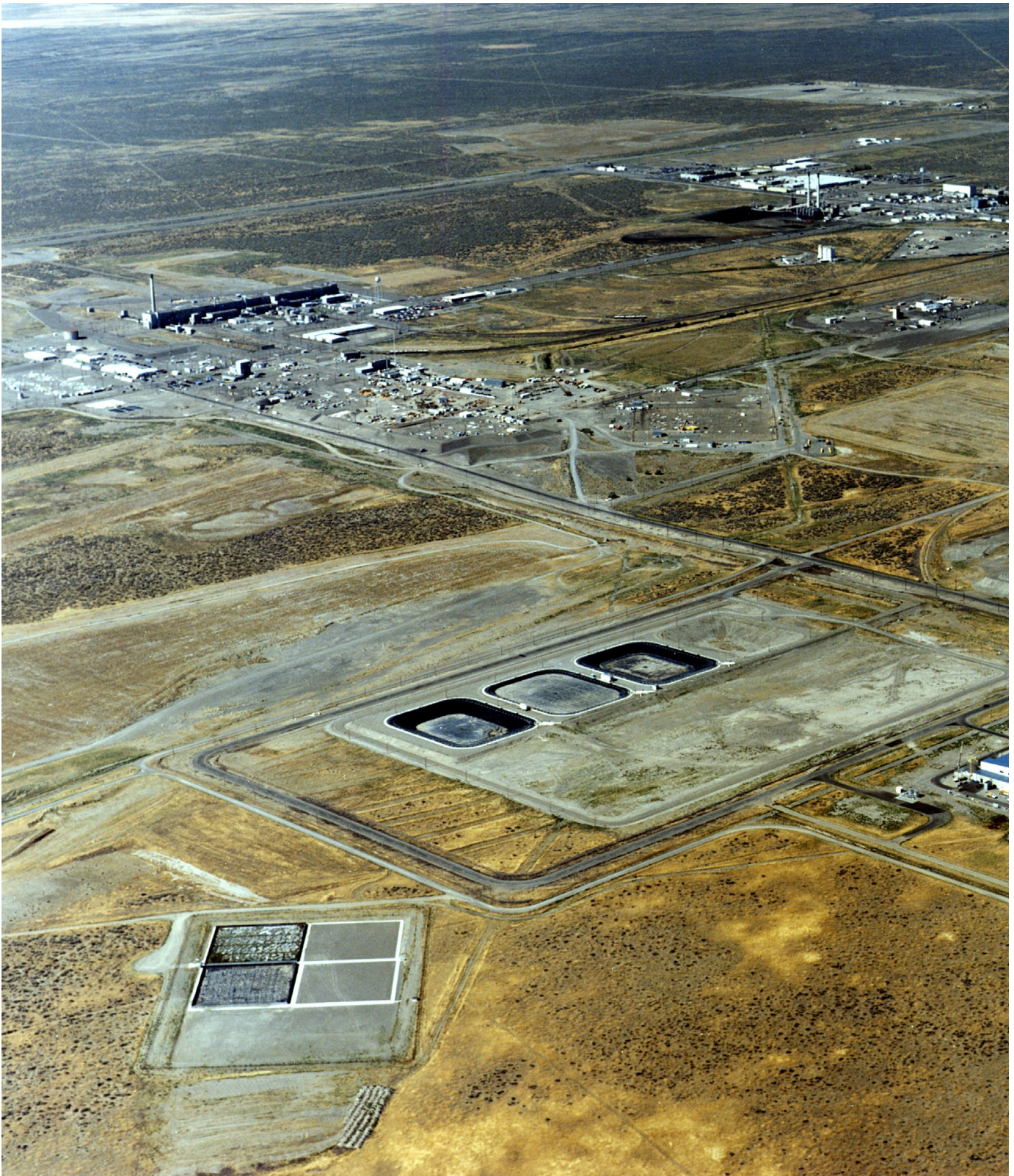
The 200 Area of the Hanford nuclear site is seen in a 1995 aerial photo.

The cost of cleanup is growing. The Energy Department estimates future nuclear waste cleanup could cost $377 billion at 16 sites across the country. GAO says taxpayers could save billions if they took a programmatic approach rather than each nuclear waste site setting its own priorities.